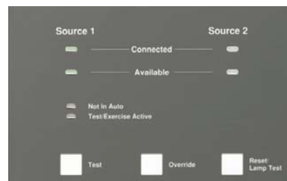
Basic indicator panel