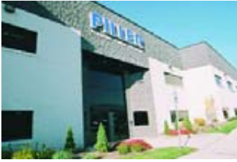
Piller Inc., NY, USA