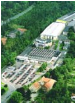
Piller headquarters, Osterode, Germany

'Commitment to providing total solutions backed by a solid service organization'